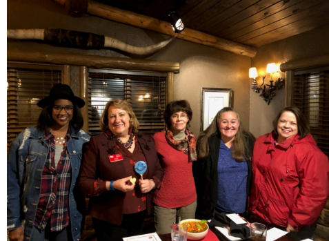
WOVI AMC members enjoy the February meeting and each other!