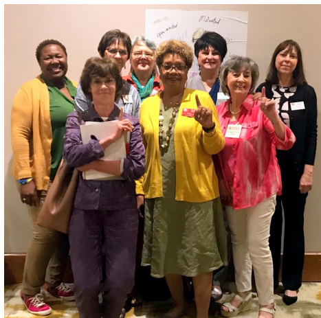
WOVI Addison celebrates being #1