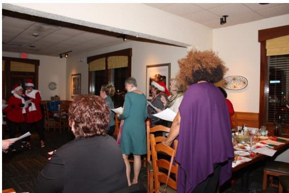
The Chipmunks led us all in singing carols.