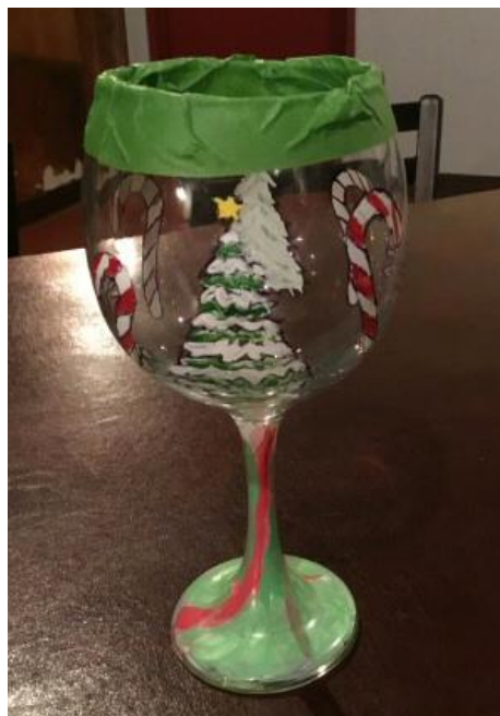
One of the spectacular creations of WOVl AMC members