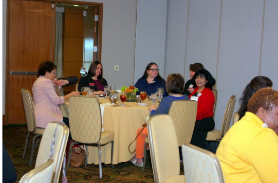
There's nothing better than breaking bread with wondrous WOVl women