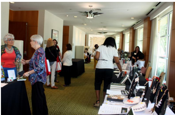
The Vendor and Author Faire offered something for everyone