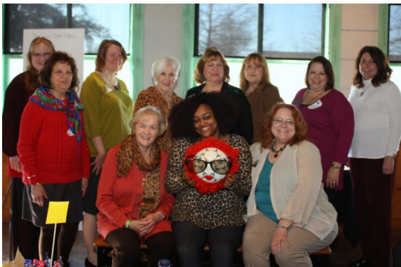
Our LeadersRing attendees!

Overall, it was a memorable afternoon with wonderful women, delightful discussions, inspiring information, superb service and lots of laughs! Plan to attend our next LeadersRing events for time well spent!