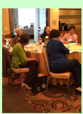
5-4-3-2-WONDERFUL!... Whenever you MOVE you get oxygen to the brain... We don't learn by experience, we learn by REFLECTING upon that experience...Mom you just think you are normal BUT YOU ARE NOT!...That's like ME! Real life doesn't happen until you are pushing the edge...Am I clear?? The Brain is YOU!