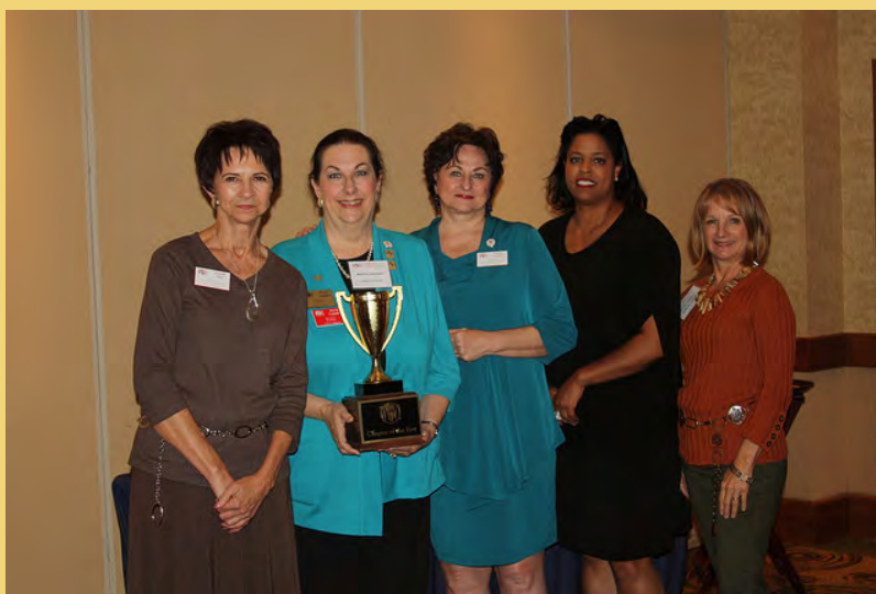
OUTSTANDING CHAPTER OF THE YEAR, WOVI ADDISON

The Outstanding Chapter award went to Addison, which has continued to set the highest standards for WOVI chapters.