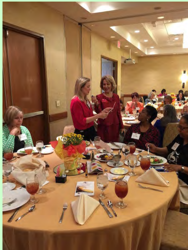
The Ice breaker was to explore clues about different women of vision and try to figure out who the famous woman was at each table.