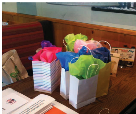
Door Prizes! We love those WOVI door prizes!