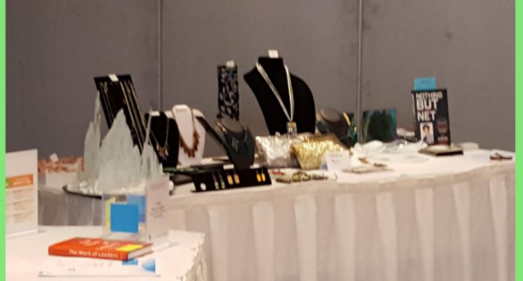
Vendor Faire venue included many wonderful products for the women to peruse and explore!